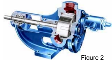
Figure 2 Cutaway view of a UL-51 listed Rotary Internal Gear Pump for handling LP gas

Due to the high vapor pressure, NPSH must not be overlooked. Placing the pump too far from the supply tank, allowing the LP gas to get too hot, or running the pump too fast may lead to cavitation, which in turn will lead to noise, reduced capacity, and reduced pump life. The LP gas pump in figure 1 features a return-to-tank pressure relief valve. This valve allows the LP gas to flow back to the supply tank when the discharge valve is closed, rather than cycling the gas through the pump. By doing so, less heat is imparted to the LP gas and the gas is not allowed to boil in the pump.